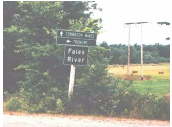
Fales River, Malvern Square, Nova Scotia, Canada