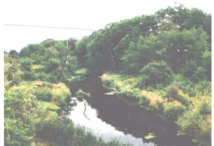
The Fales River, Malvern Square, Nova Scotia Canada